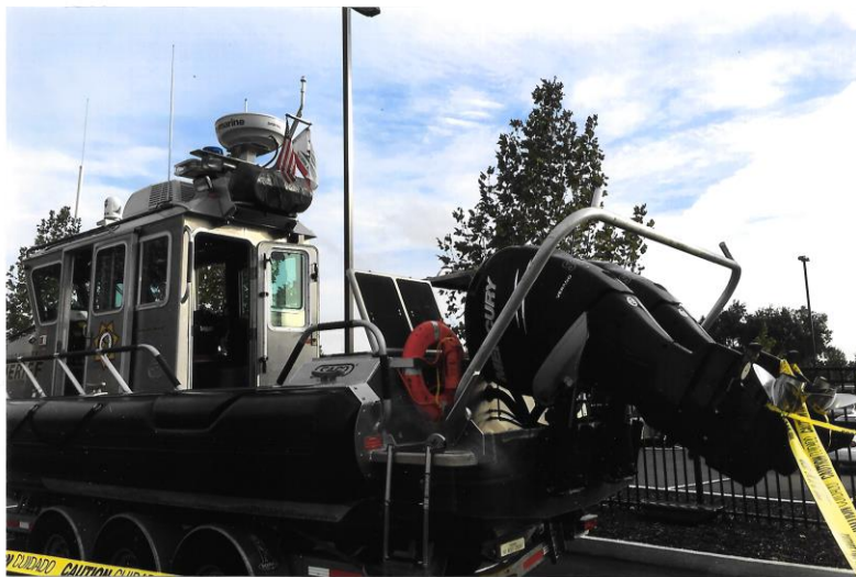
Defender 250 SAFE BOAT