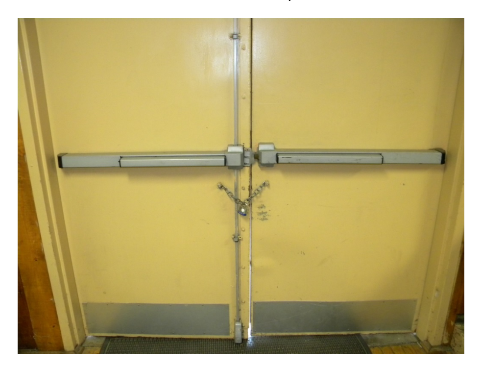
#8 Chained exit door #31