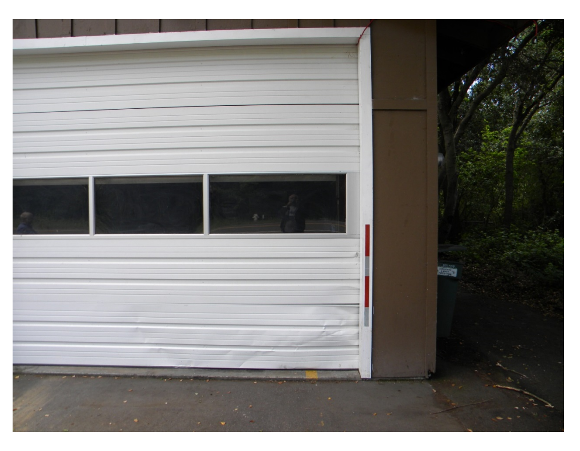
#19 Station # 29 damaged door