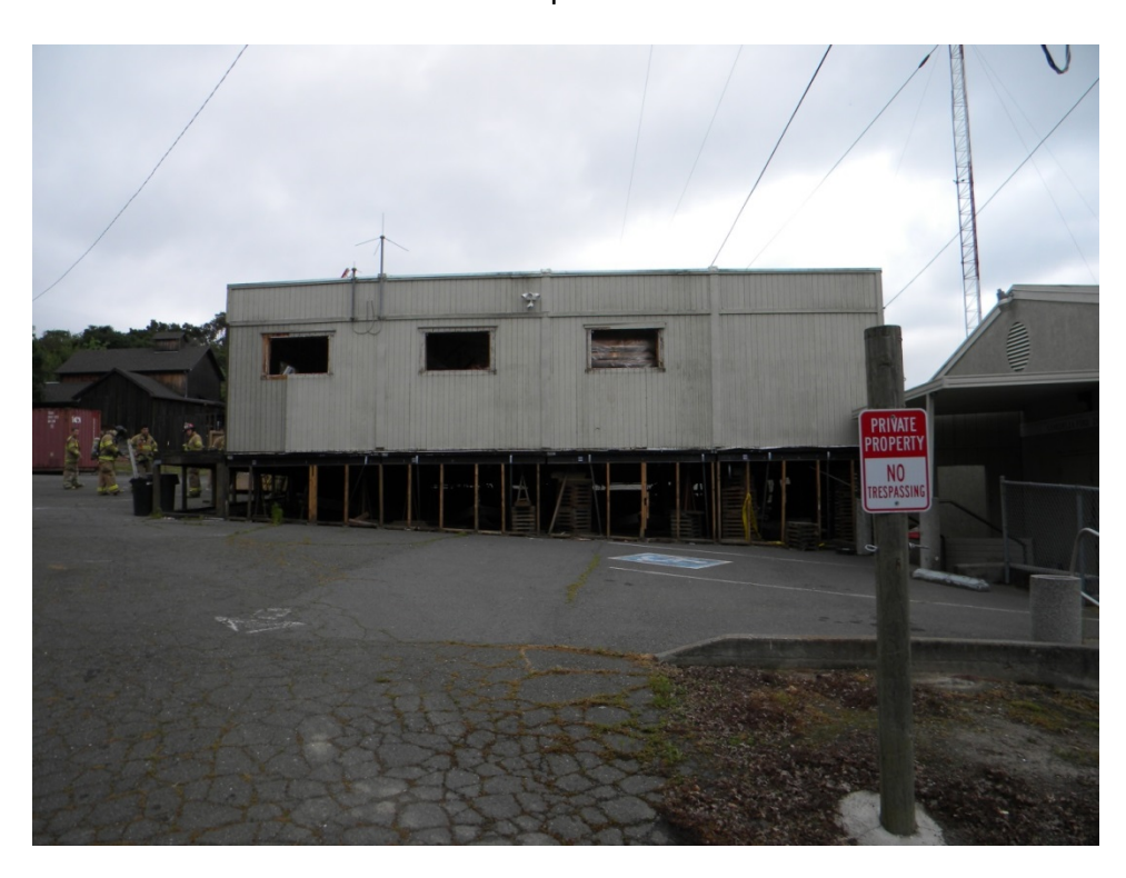
#2 Old sleeping quarters at Station# 31