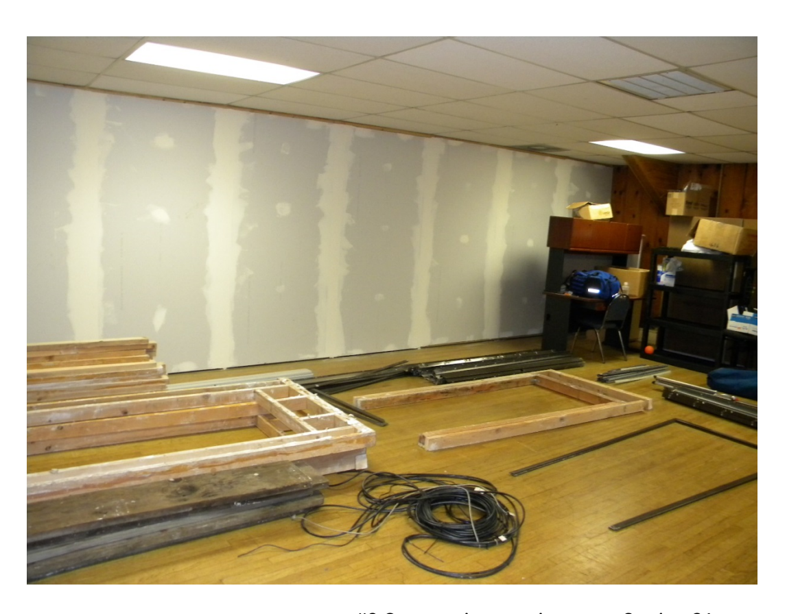
#9 Community meeting room Station 31