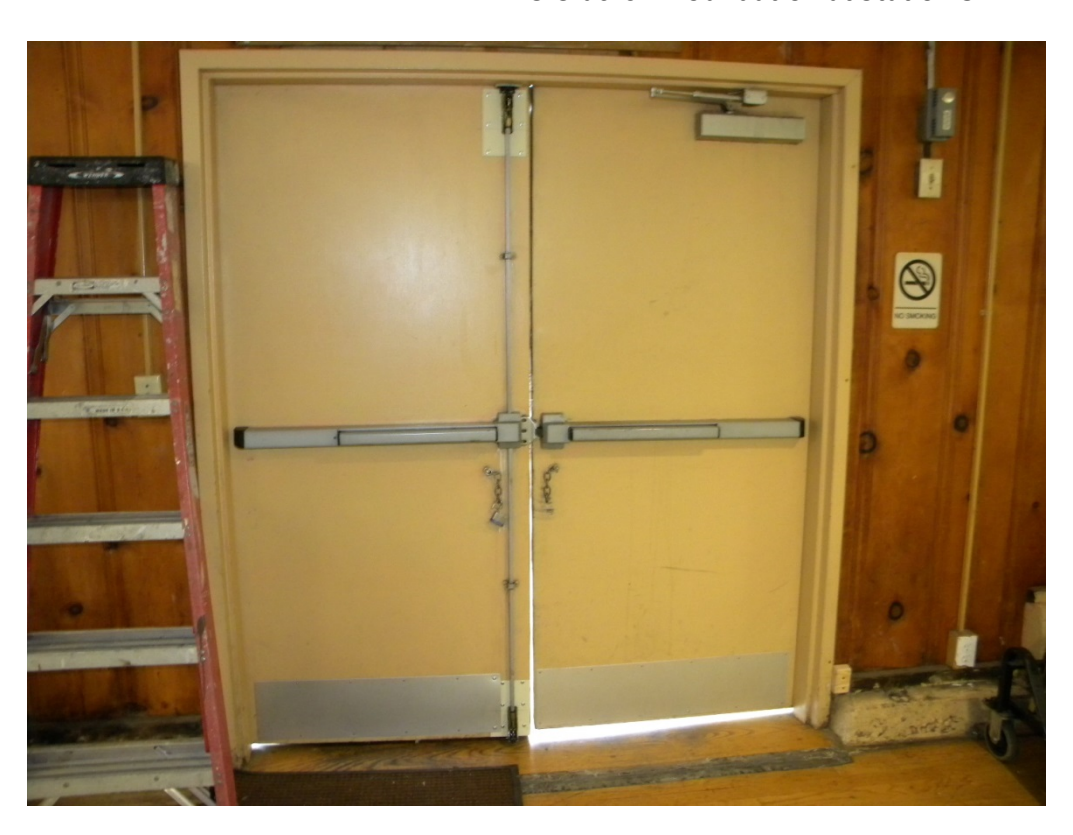
#6 Station #31 exit door