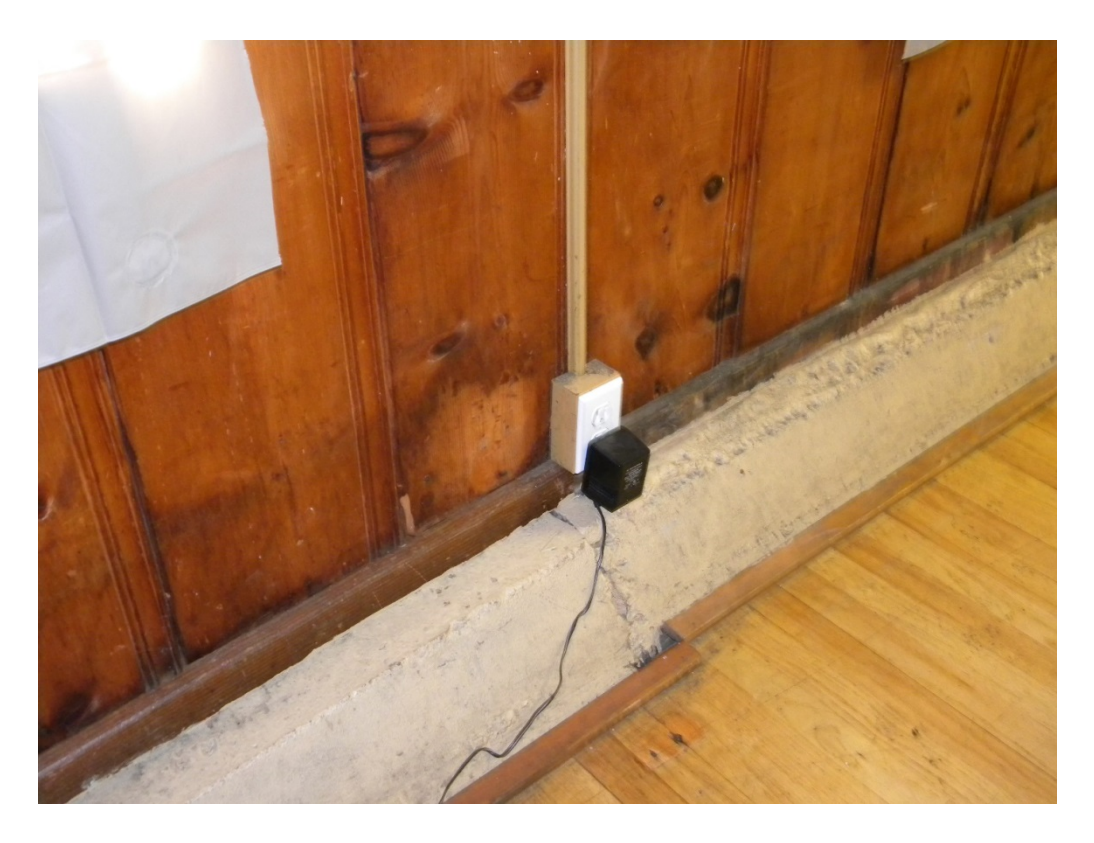
# 5 Cracks in foundation at Station 31