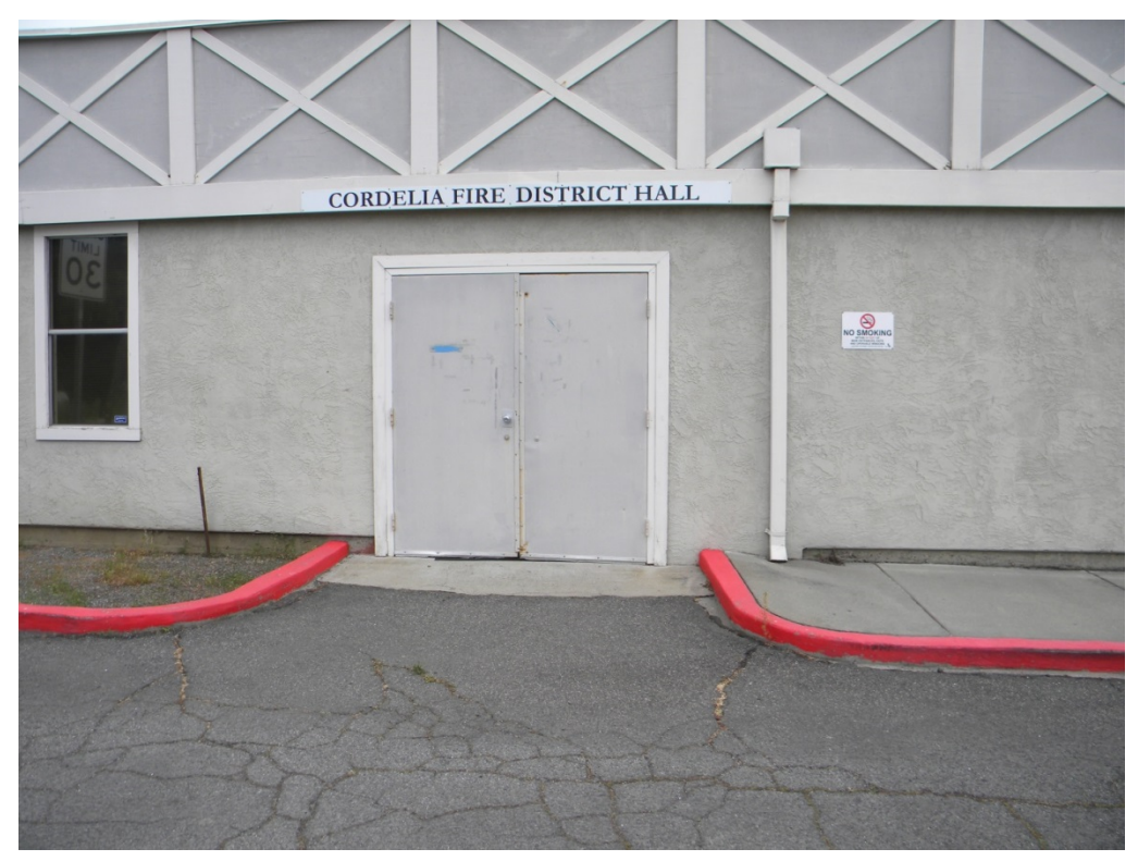
#1 Gap under the door Station #31