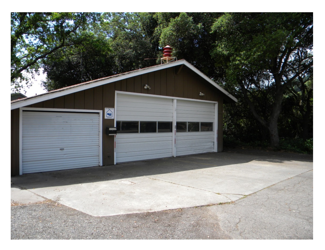
#15 Station # 29 damaged door far right