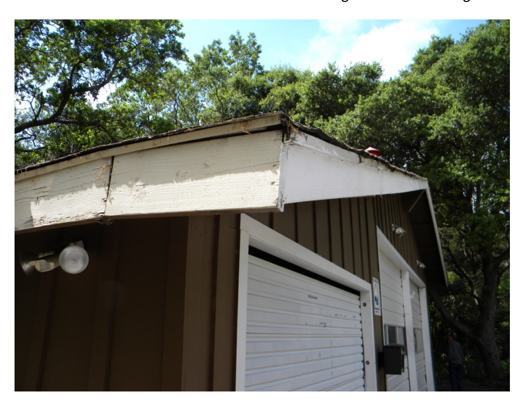
#16 Roofing overhang 29