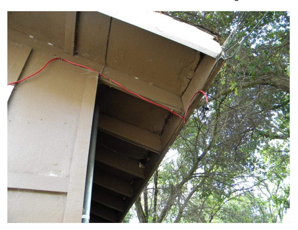
#20 Roof Station #29