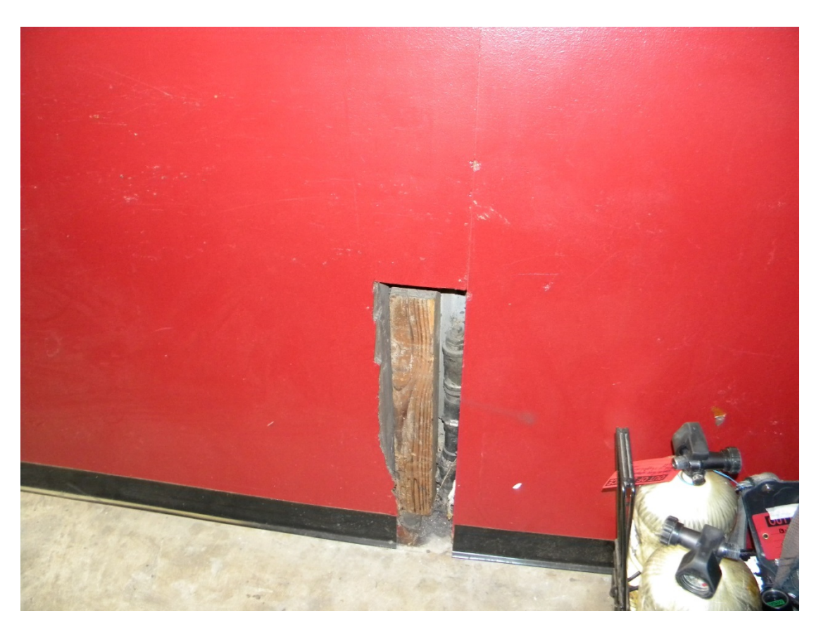
#13 Structural damage Station #31