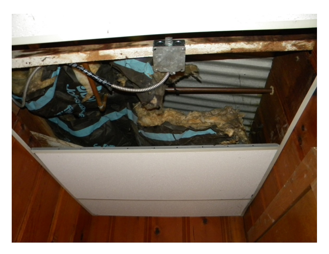
#11 Ceiling panels above restrooms 31