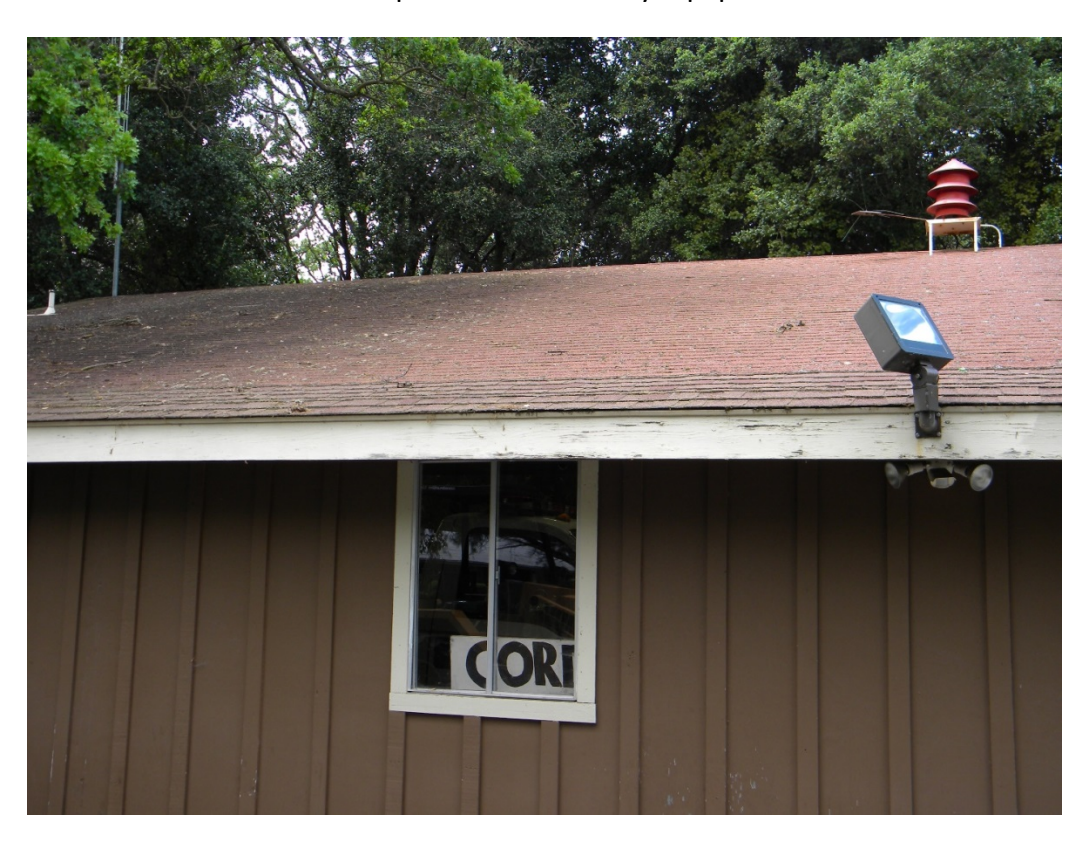
#22 Roof Station #29