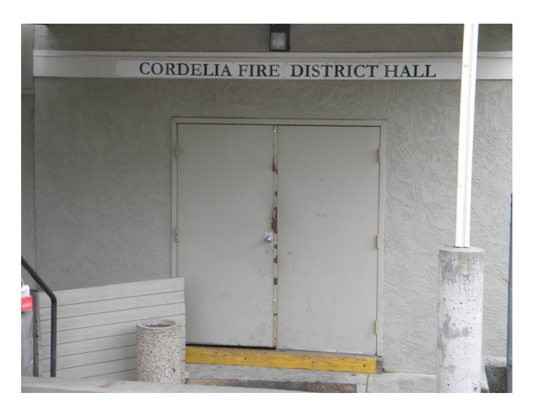
#3 Exterior of Station #31