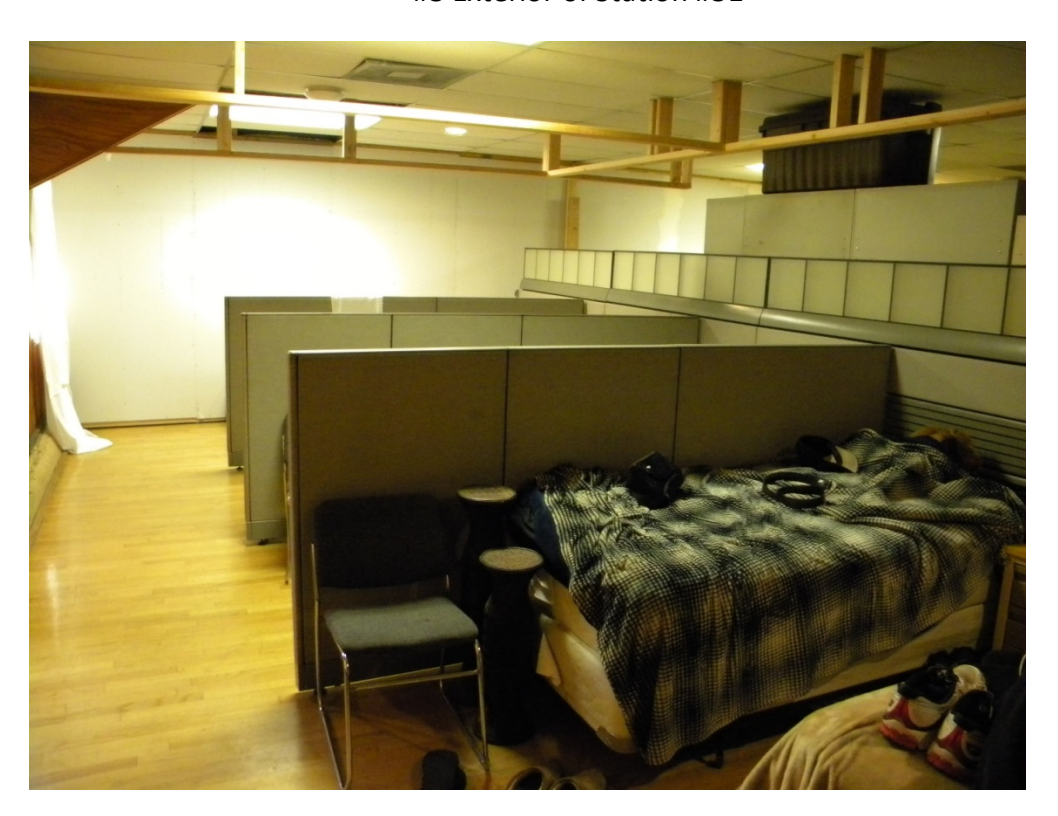
#4 sleeping quarters Station #31