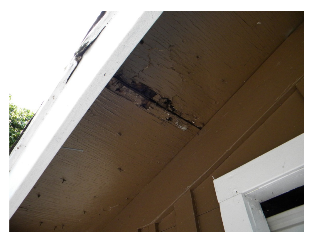
#17 Dry rot station 29