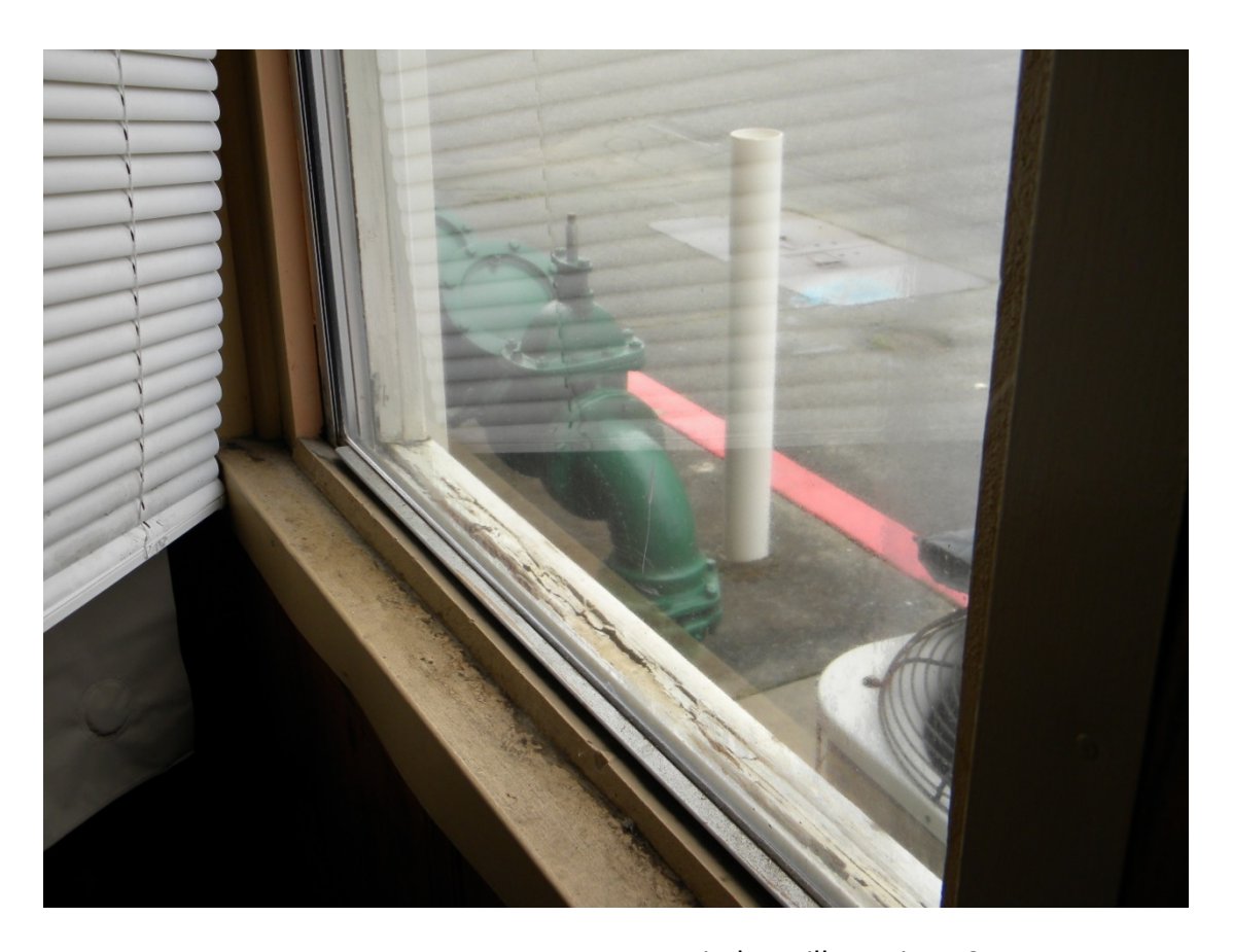
#7 Dry rot window sills station #31