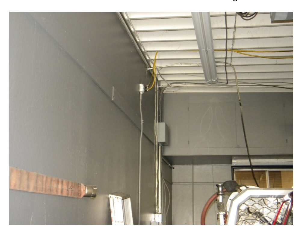
#14 Electrical problems Station #31