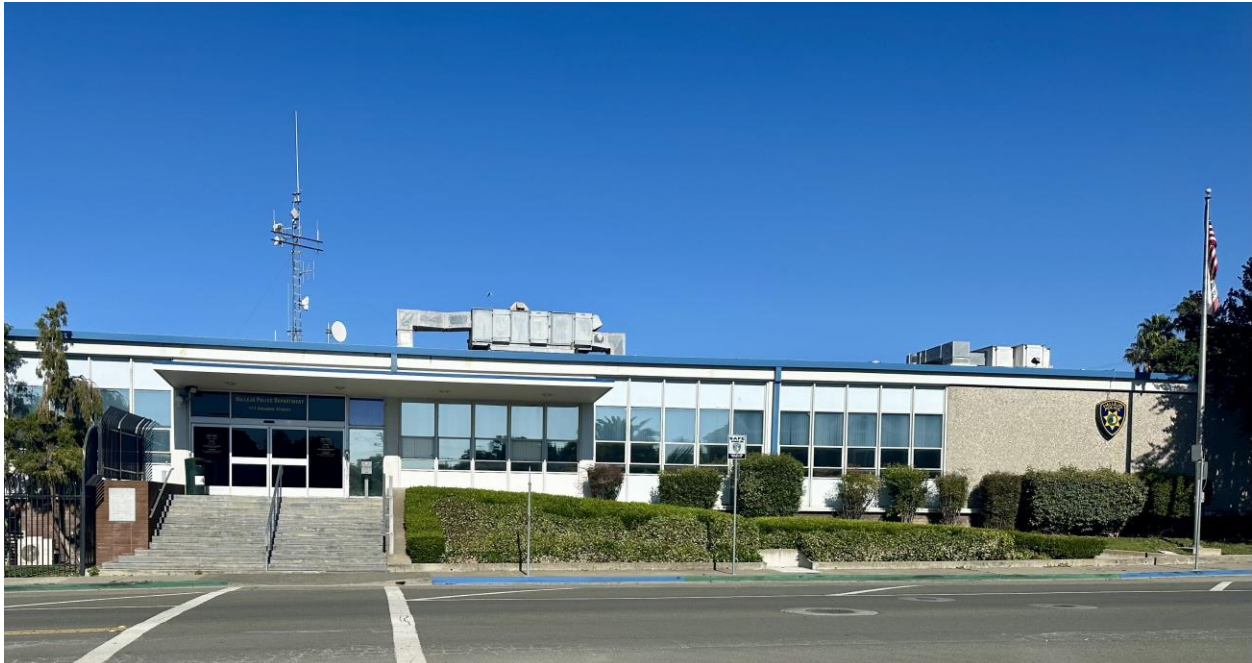
Figure 1: Picture shows a street view of the Vallejo Police Department located at 111 Amador St, Vallejo, CA

This report is a follow-up investigation into Vallejo Police Department (VPD) emergency response times, outlined in a prior Solano County Civil Grand Jury (Jury) investigation published June 23, 2023. VPD response times averaged over 80 minutes, and this report examines what has changed and what remains unresolved. A contract with the Solano County Sheriff's Office providing patrol officers in Vallejo has resulted in reduced response times; however, that contract expires December 31, 2026, and leaves concerns about response times in the future.