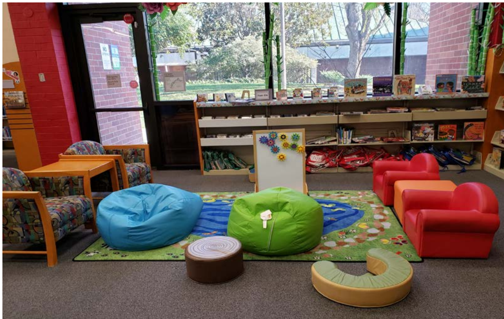
Photo: Fairfield Civic Center Library Children's Section. Child-size furniture donated by Solano First Five

The Fairfield Civic Center has a large, designated children's area with furniture specifically for the children donated by Solano First Five. Staff can show their creativity with an I Spy cabinet located near the desk with printed instructions on what to look for. The library provides access to an adjacent pond, which provides opportunities for picnicking, feeding ducks, and a family trip to the library.