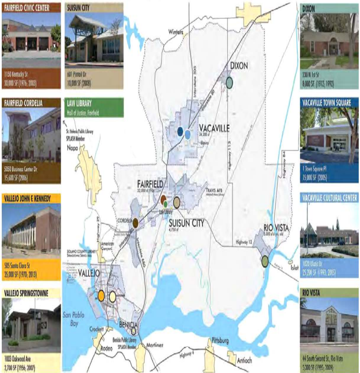
Source: Solano County Library Facilities Master Plan