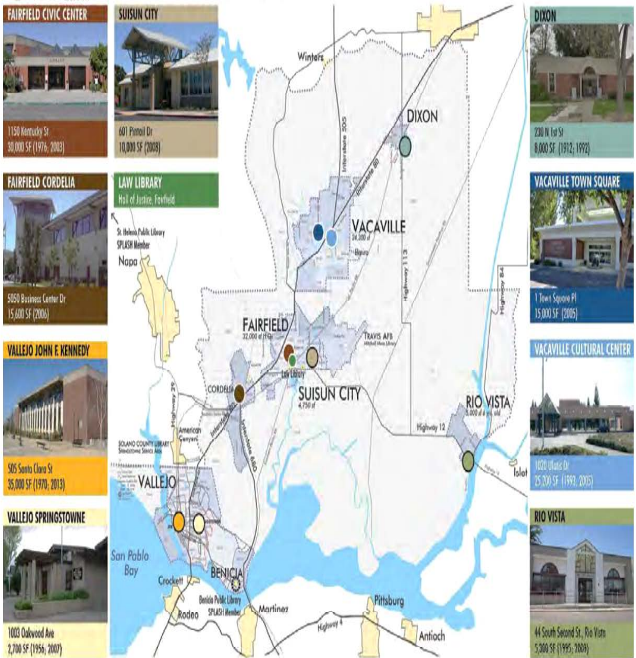
Source: Solano County Library Facilities Master Plan